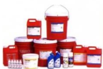
Professional Cleaning Chemicals