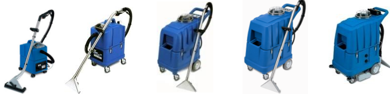
SE 20 SE 30 SE 60 SE 70 SE 75T

TYPHOON SE75T is a self-propelled machine designed to clean very large areas of carpet. It washes, brushes and dries a stripe of 50cm of carpet, going forward with adjustable speed. The differential of the driving motor allows the machine to turn without effort, giving it a good maneuverability even in narrow areas, as for example in corridors. The pressure of the rotating brush and the water flow sprayed on the carpet can be regulated. This machine is ideal for cleaning companies, hotels, conference halls, banks and big offices, shopping centers, airports and all places with vast carpet surfaces.