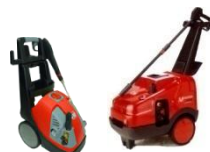
Monsoon High Pressure Water Cleaner