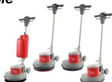
Cyclone Single Disc Floor Machines