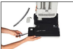
Easy brush strip change, without the use of tools