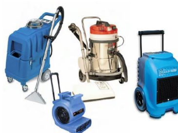
TYPHOON Carpet Extraction Machines, Blowers & Dehumidifier