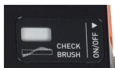
Brush Monitoring & Motor Protection