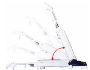
Various angles for cleaning under furniture