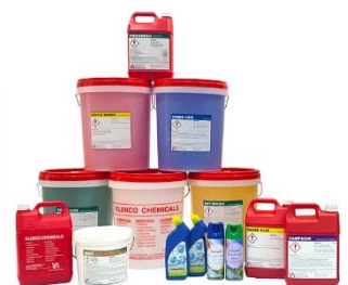
KLENCO Professional Cleaning Chemicals