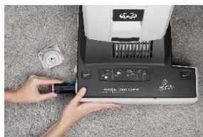
Convenient brush replacement