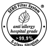
S-Class Filtration Logo