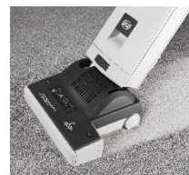
Automatic brush height adjustment