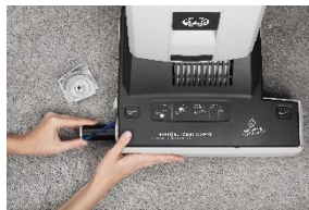
Convenient brush replacement