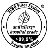
S-Class Filtration Logo