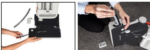
Easy brush strip change, without the use of tools

Various angles for cleaning under furniture