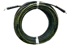
30m high pressure hose; highly abrasion resistant, lightweight with quick couplings