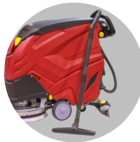
External Suction Kit vacuums liquids in hard to reach areas (optional).