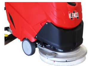
Lava 650 - Single Disc Version