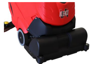
Lava 655R – Cylindrical Version