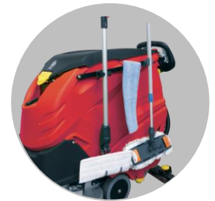
Tool Bar , positioned on the left, can hold up to 5 different types of manual cleaning tools (optional).