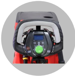
Adjustable and Ergonomic Handle , User Friendly Control Panel .

LAVA 650 & LAVA 655R are heavy duty battery-operated autoscrubbers that deliver professional floor cleaning, boosting productivity and operator ease as they clean floors in a single pass. With their innovative design and numerous unique features, floor cleaning of large areas is now made simple.