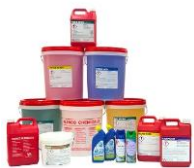
Professional Cleaning Chemicals