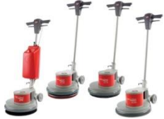
Cyclone Single Disc Floor Machines