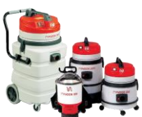
Typhoon Wet/Dry Vacuum Cleaners